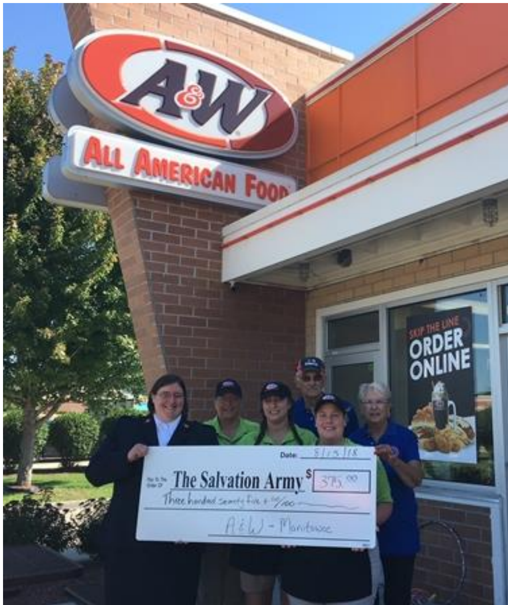
KMCC Show Check Presentation to the Salvation Army - $375.00