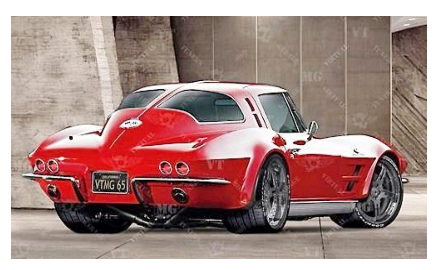
A Superb Wide Body '63

Spring Is Here, But Warm Weather Needs To Arrive